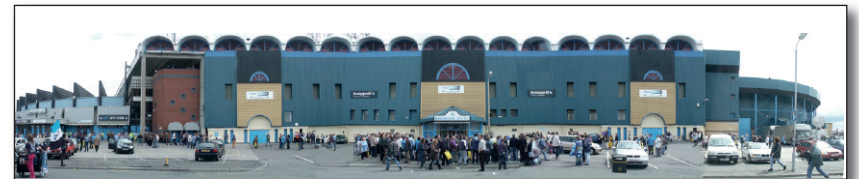
The Final Game at Maine Road – City v Southampton 0-1 May 11th 2003