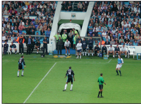
City v Coventry City 1-2 August 2000