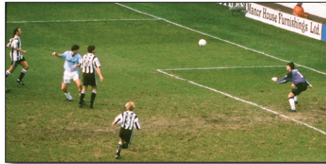
City v Newcastle United 3-3 February 1996