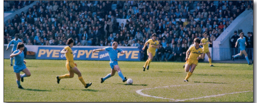
City v Everton 3-1 April 1981