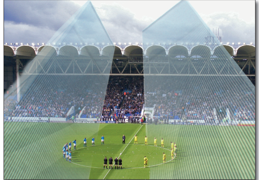
City v Birmingham City 3-0 September 2001. The minute's silence before the game was impeccably observed in memory of the events of 9/11 in New York.