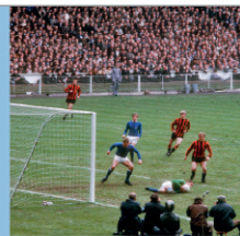
Shilton saves - watched by Bell and Lee.