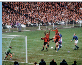
City players copped for offside.