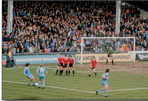
City v Bristol City 2-0 May 1979