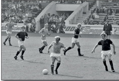
City v Burnley 0-1 August 1973 Charity Shield