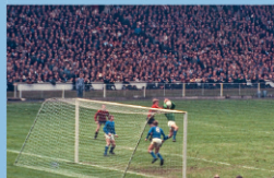
Shilton scores under pressure from Bell.